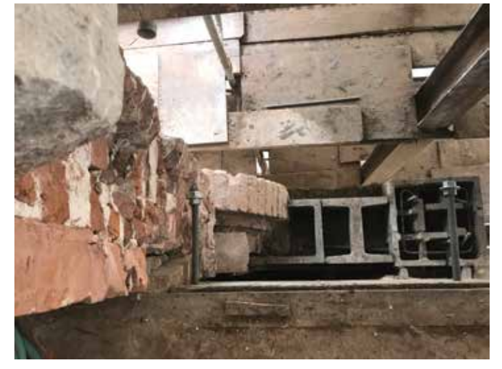
Figure 5. Detail of CMU interface with historic brick arch

The unique condition of anchoring new CMU walls to existing inplace ceiling framing allowed for cast-in-place anchorage to be located