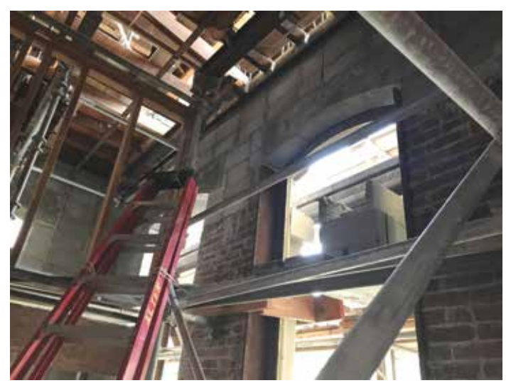
Figure 6. CMU and precast lintel construction above the original brick wall.