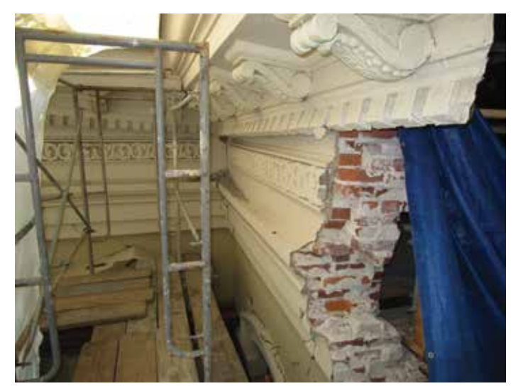
Figure 2. Historic exterior wall brick construction and dental cornice.

Early in the repair design, the design team considered using traditional Fiber Reinforced Polymer (FRP) overlay on brick walls demonstrating extensive cracking. Due to surface preparation requirements and material incompatibilities of FRP (epoxy resin vs clay and mortar), the team turned to a new overlay product uniquely suited for brick masonry construction called Fabric Reinforced Cementitious Matrix (FRCM) used extensively in Europe. FRCM was used to repair brick