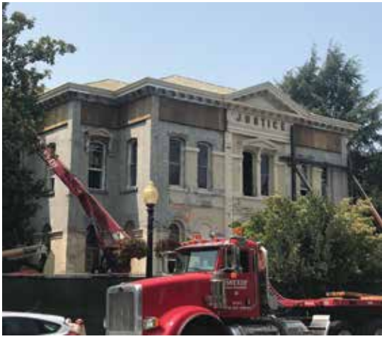
Figure 4. CMU reconstruction of damaged 2<sup>nd</sup>-floor walls.

masonry walls with significant cracking but minimal permanent deformations, and to provide continuity through floors, walls, and around corners. As a new product being brought to the United States by manufacturers, including Simpson Strong-Tie, FRCM presented several challenges and opportunities from design through construction. These will be discussed in a future Part 3 article in STRUCTURE.