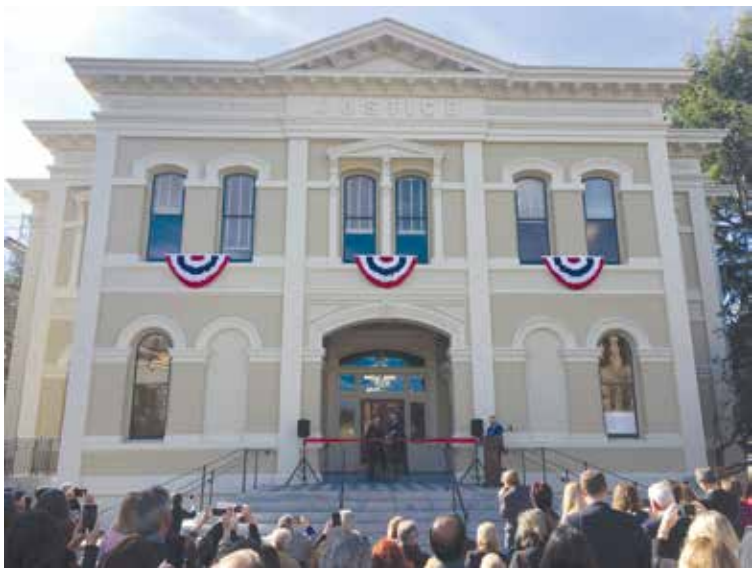
Figure 8. Grand opening on January 22, 2019.

In addition to material similarities, CMU was used in the project for its adjustability to accommodate small dimensional variations in the existing structure. Modern construction procedures and metrics focus on installing materials straight, true, and plumb rather than matching existing conditions. The roof and second floor experienced small permanent displacements, which were compounded with plan dimension variations along the length and height of each wall. This created a challenge in